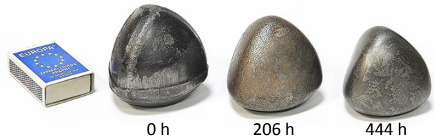
Fig. 5 shows samples of the energy saving grinding bodies model "Reloe – M1.1" before the milling and samples after 206 and 444 hours of operation.

Similar observation was conducted also after 444 hours of operation. It was approved that the grinding bodies retain their shape, obtained after 206 hours of operation and after 444 hours of operation.