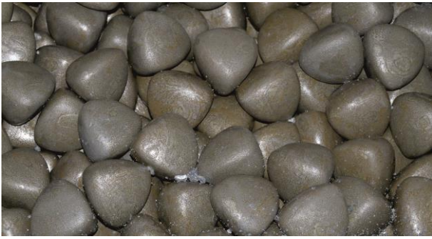
Fig. 4: Energy saving grinding bodies in the mill after 206 hours of operation.

After 206 hours of working in extremely abrasive environments they have doubled their rounded edges and the new body then has only six rounded edges. Since the average weight of the worn out grinding bodies is already 0,880 kg, which means that the reduction of the mass of these bodies is on average by 0,131 kg. The decrease in size of the tops and spherical sides is in the range of 2-3 mm. The double edges have already fulfilled their purpose by destroying the material when the bodies had had an initial mass of 1,011 kg and then, with the rounded edges, the new bodies were fully involved in the milling of the ore. Measurement of the mass of separate worn out grinding bodies showed deviation of their mass by no more than 5 %.