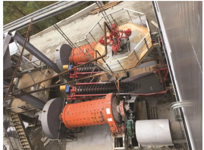
Fig. 1: View of the two mills, M1 (top) and M2.

2D. Grinding bodies: For milling of the ore are used grinding bodies of spherical shape and diameter of 60 mm, as the mills are charged with 6 to 8 t bodies, which determines that filling of the mills is not less than 45-50 %. In this case were used stamped by rails grinding spherical bodies produced by a company in Poland.